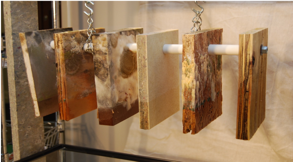
Figure 3: Test samples after 30 days in testing tank. Note mold growth on all the boards except Nyloboard (fourth from left)